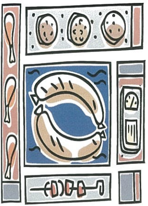
Coverage for Barbecues/Picnics, Exhibitions, Flower Shows, Home & Garden Shows, Arts & Crafts Fairs/Shows and more.